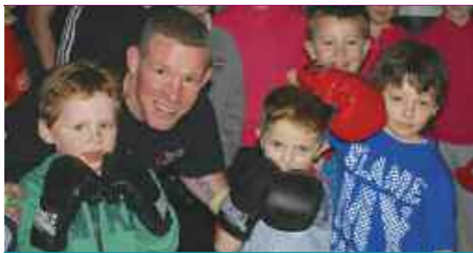
Charlie Shepherd - ex-world boxing champion teaches a group of young people fitness through boxing training.

There are 50% less cases than there were last month.