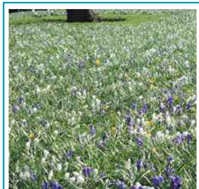
Beautiful display of Spring bulbs at Millriggs in March 2009

Tree Stumps have been removed from pavements and holes filled with tarmac. Some cobbled areas have been tarmaced over too.