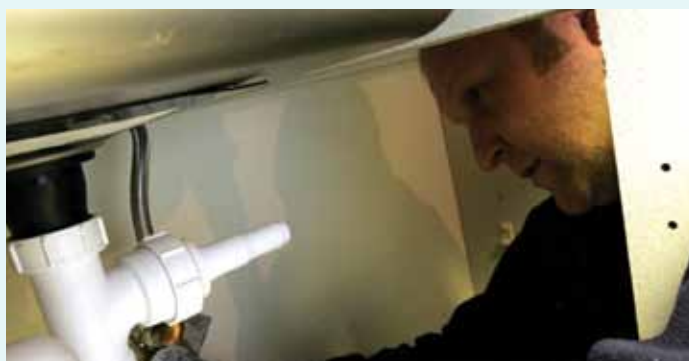
We are reviewing our repairs contract