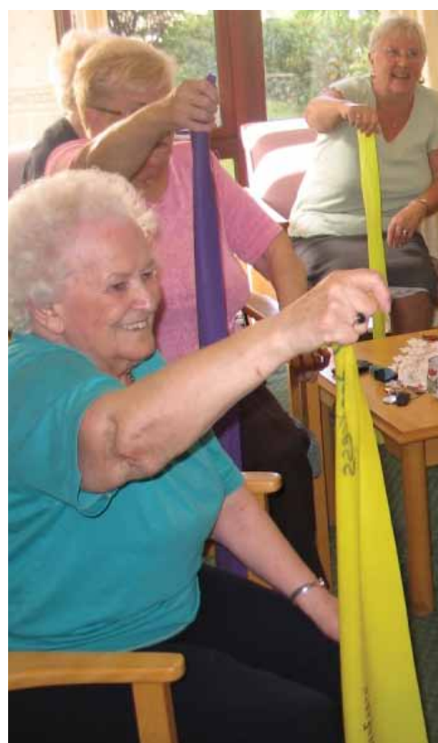
Residents enjoy taster sessions of armchair exercises

The day coincided with the International Day of Older Persons and was funded by Riverside's Community Investment fund.